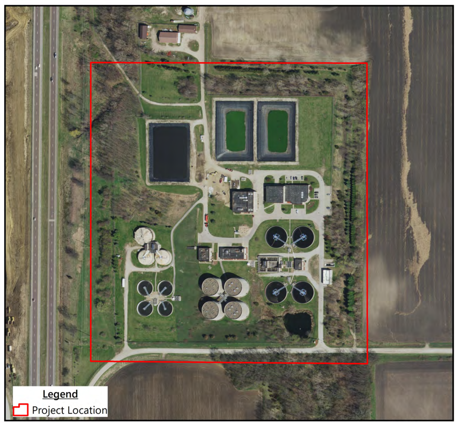
WPCF Nutrient Reduction Project - Phase 1 Ames, Iowa